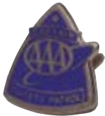
Captain blue on silver 3147