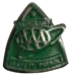
Sergeant green on silver 3123

These miniature, lapel-size versions of the patrol member badges may be used as an end-of-the-year award.