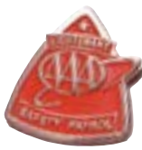
Lieutenant red on silver 3148